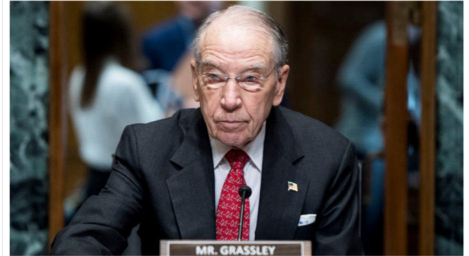
Senator Chuck Grassley (R-IA) has been concerned about foreign powers poaching U.S.-funded research.