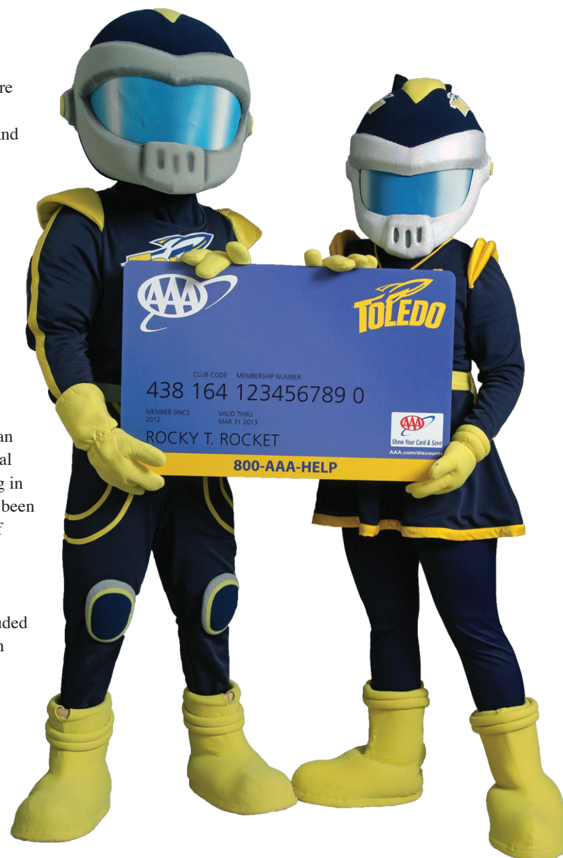
UT SPIRIT TO GO: Rocky and Rocksy show off the new UT Rockets AAA membership card.

The University has a similar partnership with Huntington Bank with the option for UT Rockets debit cards. The Toledo Fire Department also included the UT Rockets logo on its Firehouse Coins, which are used to honor special occasions, and the Lucas County Auditor’s Office has incorporated the logo in its inspection seals.