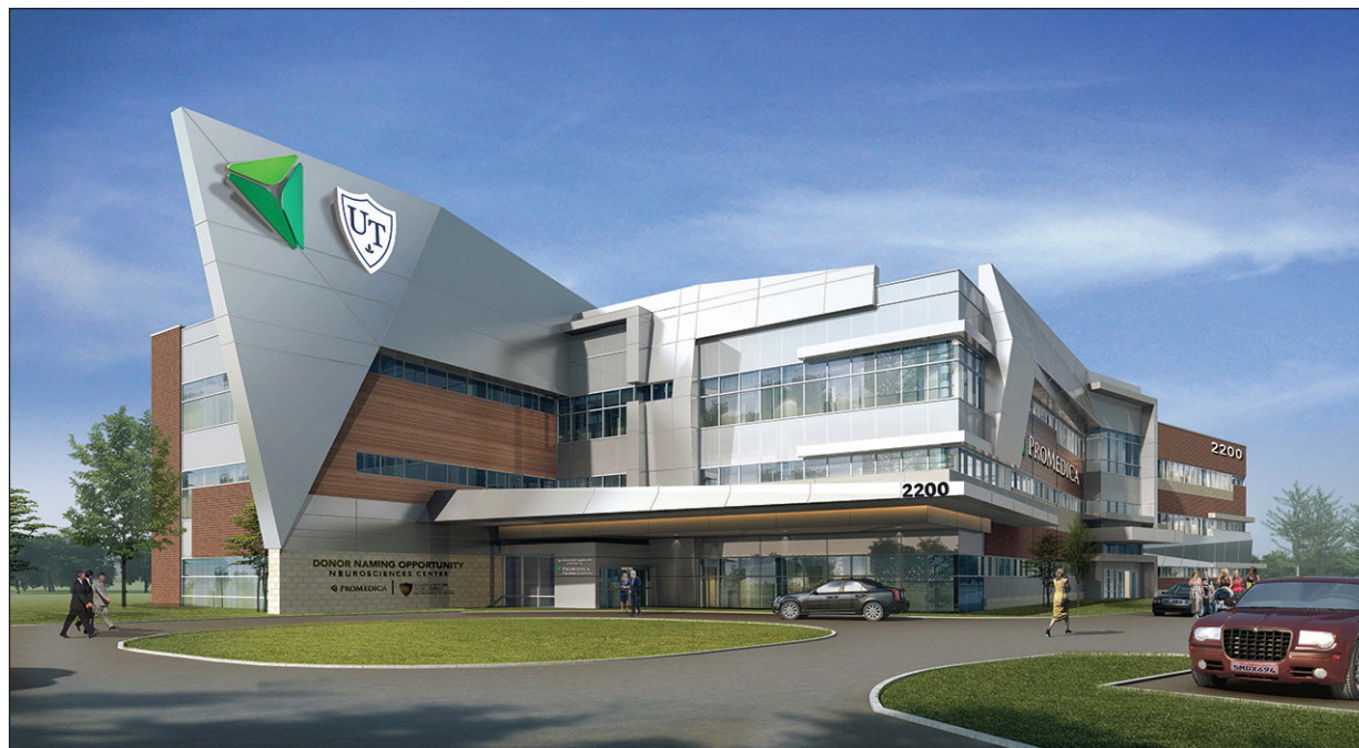
COMING SOON: The joint Neurosciences Center, shown in this rendering, is scheduled to open in April.