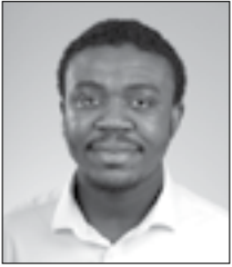
Prince Ababio Medical Science